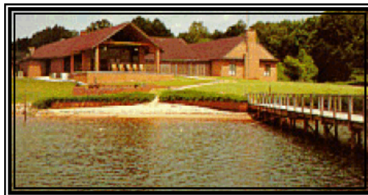
Weekends are held at the conference-center style facilities of beautiful Camp Dogwood located 30+ miles north of Charlotte on the shores of Lake Norman.

You can attend a Tres Dias weekend by filling out an application and obtaining a sponsor (someone who has previously attended a weekend). If a friend or family member gave you this brochure, they will likely be your sponsor and can answer many of your questions and guide you in your application. Else, go to our website www.mctd.net or call the persons named on the back of this brochure.